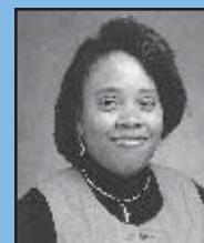
Lori Lamar Event Management